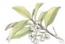
Cairns Branch of the Society for Growing Australian Plants - SGAP

Awarded to the Exhibitor who gains the most points in Classes 22096 - 22102.