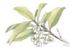
Cairns Branch of the Society for Growing Australian Plants - SGAP

Awarded to the Exhibitor who gains the most points in Classes 22096 - 22102.